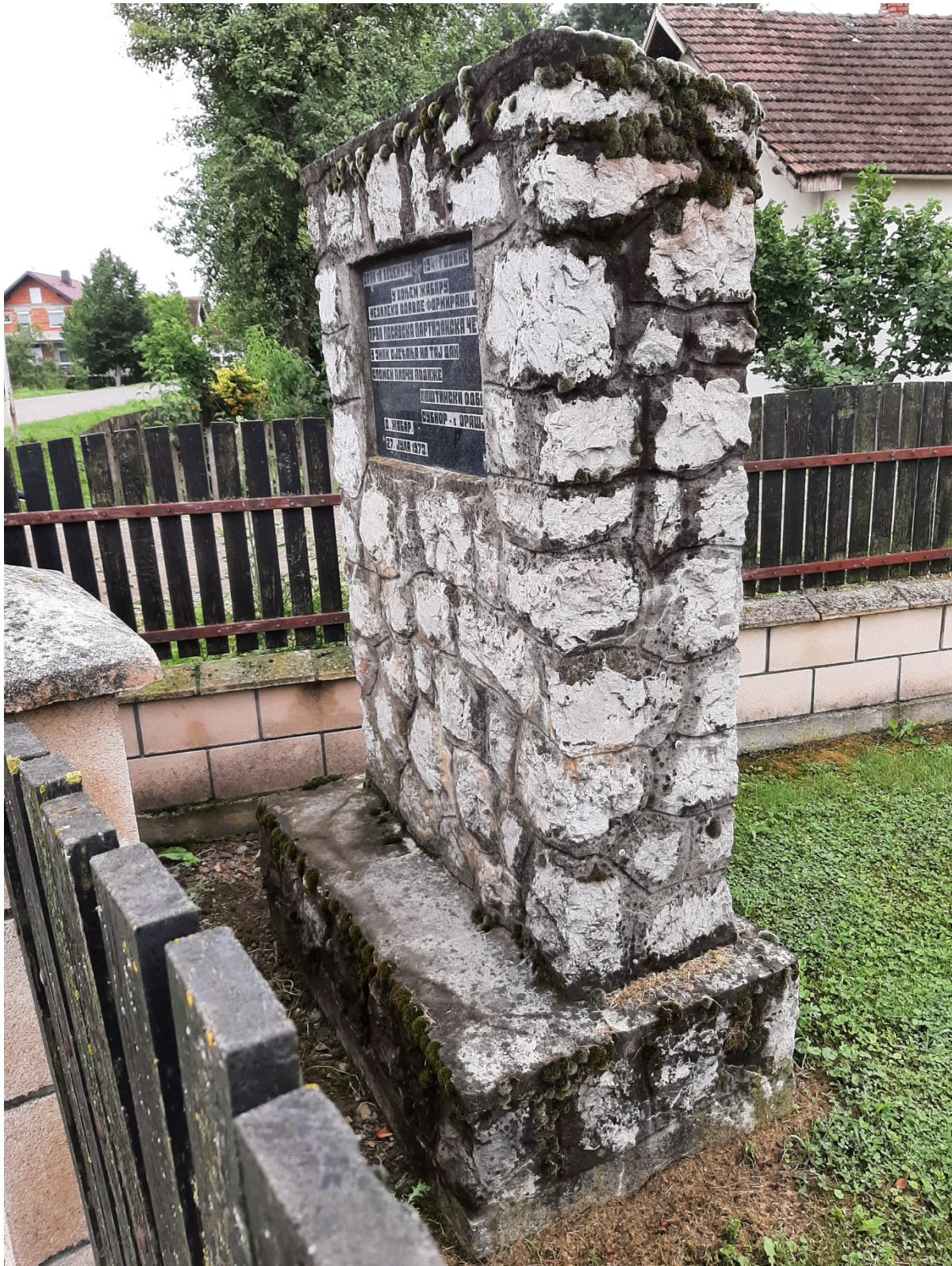
Figure 1a: Monument in June 2020