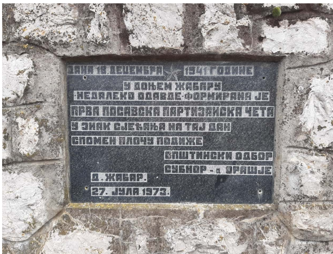
Figure 1b: Inscription on the plaque, June 2020

This monument lies in the centre of the settlement of Donji Žabar, outside a residential property with the address Svetog Save 87, at a crossroads situated a few hundred metres south of the local elementary school. The monument was unveiled in 1973, although its author is unknown.